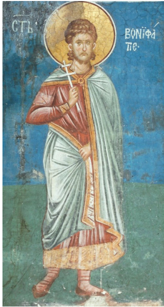
Holy Martyr Boniface, Comm Dec 19

Prayer of the Holy Martyr Boniface, shortly before he was beheaded. He is remembered along with Saint Aglais (Aglaida).