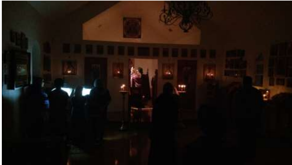
The Prayer of St Ephrem, being said during Presanctified Liturgy, at St. Nicholas Orthodox Church.

As a verbatim prayer, it mentions some of the worst and more prevalent sins, that almost all of us commit, and some of the greatest virtues, of which we lack. It is not meant to be comprehensive, and list all sins and virtues, but it still covers most of them.