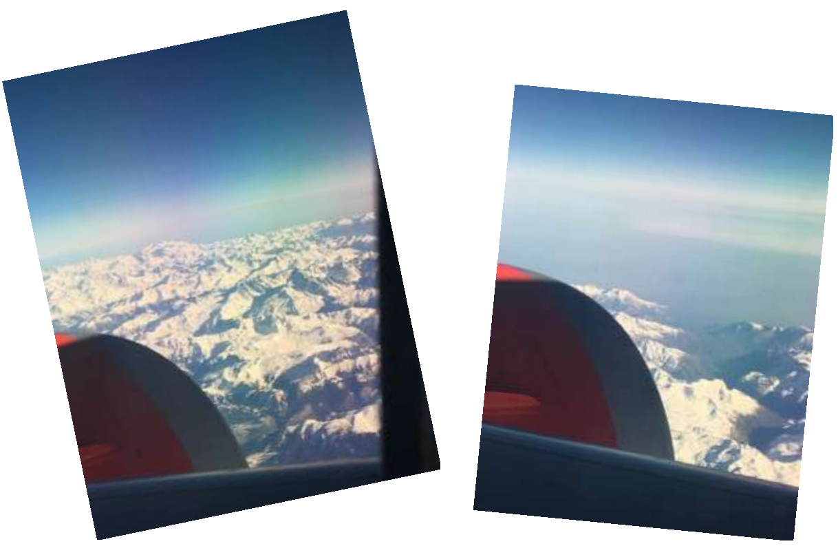
We flew over a huge range of snow-covered mountains. And then they abruptly ended. Further south

We took a 25 minute bus ride to where the plane was waiting, then got out and walked through the 1\,\% " of snow to climb up into the plane. It was COLD and WINDY, and we were dressed for Kenya.