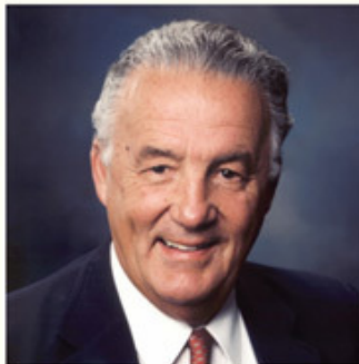
HONORARY GALA CHAIRMAN Hon. Paul Sarbanes, Former U.S. Senator